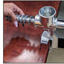
4. Insert scroll into housing.