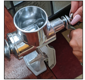
5. Attach handle to the rear with handle wing nut & plate.