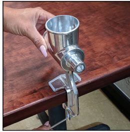
2. Clamp housing to a table.