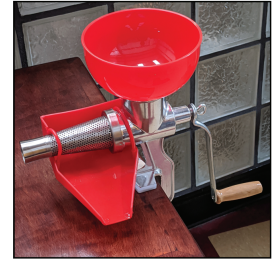
10. Ready to use and process your favorite fruit or vegetable.