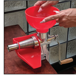
9. Insert bowl and twist to lock to the top of the housing.