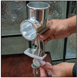
1. Attach covers to clamp.