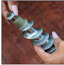
3. Put nylon bushing first, then pressure bushing onto rear of scroll.