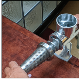
7. Slide screen over scroll and twist to lock in place.