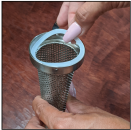
6. Insert nylon gasket into screen.