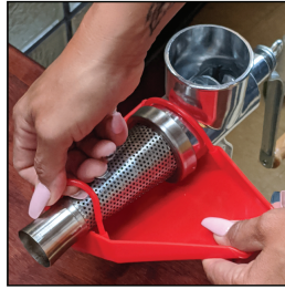
8. Attach tray under screen.